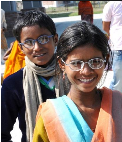
incl. 2,427 Paediatric Surgeries