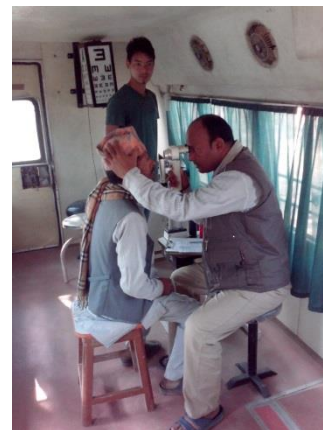
Mobile eye clinic

Sagarmatha Choudhary Eye Hospital, Lahan has started a mobile eye clinic in a bus provided by Nepal Netra Jyoti Sangh. The Mobile eye clinic is equipped with slit lamp, edging machine for optical dispensing and has pharmacy service. The mobile eye clinic services are being provided in three places of Siraha, Saptari & Udaypur districts.